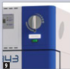
9 Internal lighting