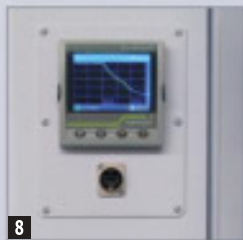
8 Temperature profiler and recorder