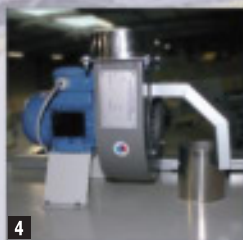
4 Air outlet extractor