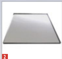
2 Recovery tray