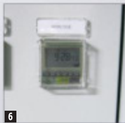
6 Digital weekly program timer