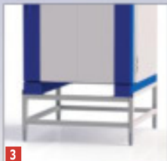
3 Subframe with feet