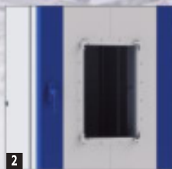
2 Door with viewing window