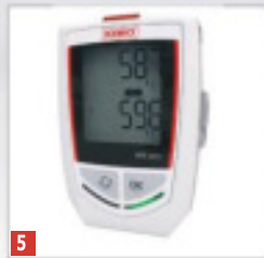
5 Data logger with 2 channels