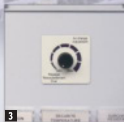
3 Fan speed controller