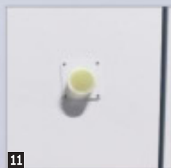
11 Access port Ø 60 mm