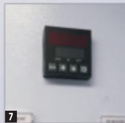
7 Temperature profiler