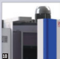
10 Fan and heating stop