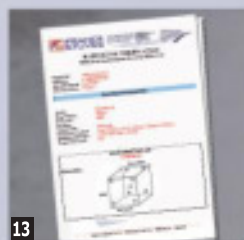
13 Homogeneity control 9 points