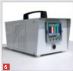
6 Portable paperless graphic recorder 4 or 6 channels