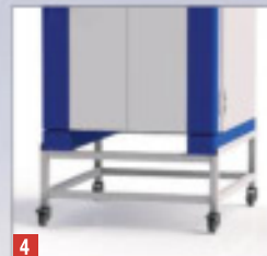
4 Subframe with castors