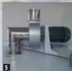
5 Air cooling extractor