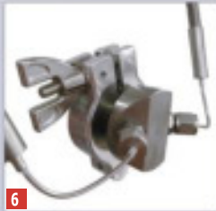
6 Probe shutter