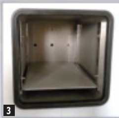
3 Door gasket made of Viton