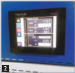
2 Temperature + vacuum profiler