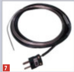
7 Thermocouple J probe