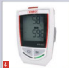
4 Data logger with 2 channels