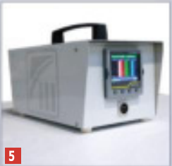
5 Portable paperless recorder with graphical screen