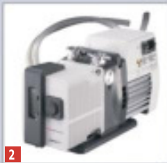
2 Vacuum kit