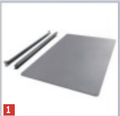
1 Tray with guide bars